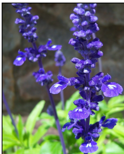
Salvia Arroyo Azul Salvia clevelandii 'Arroyo Azul'