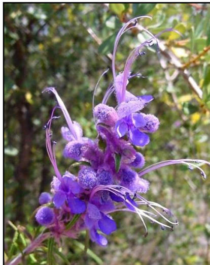
Woolly Blue Curls Trichostema lanatum