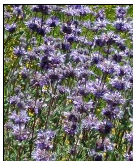
Pozo Blue Sage Salvia clevelandii 'Pozo Blue'